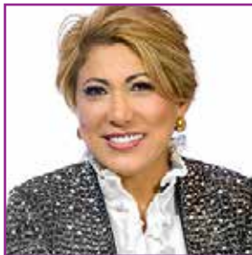
Inner Circle Executive National Sales Director