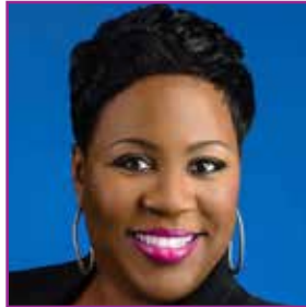
National Sales Director